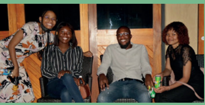
Four IT and Computer Sciences alumni

The future belongs to those who prepare for it today